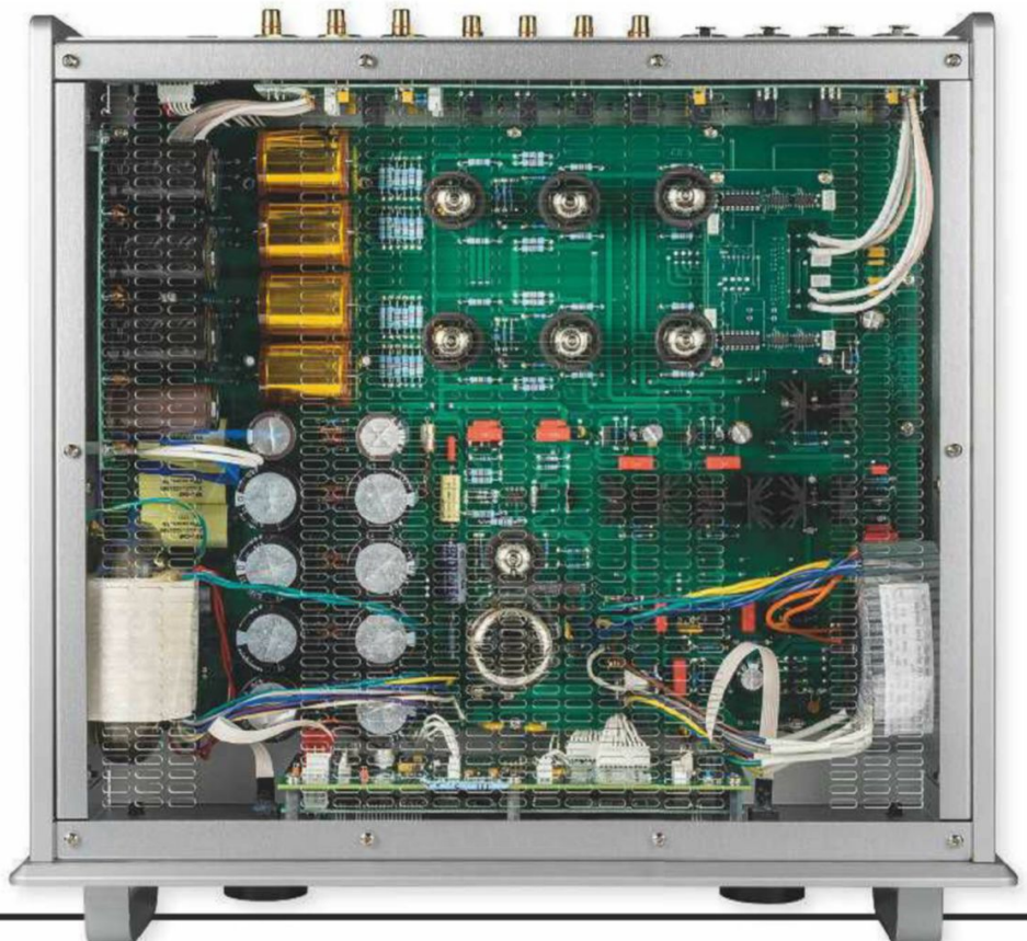
RIGHT: The vacuum tube audio stage employs six 6H30 triode tubes (three per channel) together with another 6H30 and 6550WE beam tetrode for regulation in the power supply

Also devised specifically for the REF 6 are the output coupling caps, 'to allow the new circuitry's linearity to be revealed, in both tonality and in image specificity'. That's a mildly vague statement, not easily ascertained by mere listening, but it helps perhaps to define the sensation one hears when moving from '5 to '6 with levels matched: the '6 has an authority that