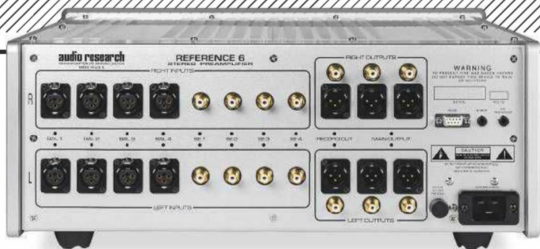
ABOVE: Line-level preamp offers four balanced (on XLR) and four single-ended (on RCA) inputs with pairs of XLR/RCA outputs (plus rec out). RS232 services automation

surprise that I was taken aback. When she thumped her acoustic guitar, the sound was so unsullied that I ran to find a facsimile (OK, my concert-sized Carvalho ukulele) just to hear the real sound of tapping on a wooden enclosure. A cigar box would have served. Regardless, it was a real wood tonality.