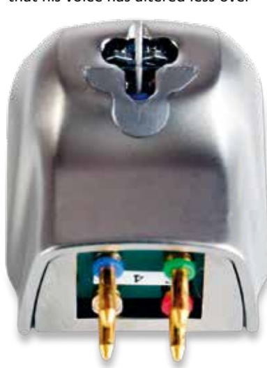
ABOVE: Alloy cantilever and fulcrum/ suspension arrangement is visible here. Cartridge pins are gold-plated and usefully spaced. Power for the internal LED is supplied via green and blue pins

More pointless than an orchestral version of Tommy is the 2020 'reimagining' of a masterpiece. Yusuf/Cat Stevens (yes, that's how he's billed) and the original producer, former Yardbird Paul Samwell-Smith, re-recorded Tea For The Tillerman <sup>2</sup> [Cat-O-Log Records 02508 88695] with mainly leaner arrangements. The DS 003 revealed that his voice has altered less over