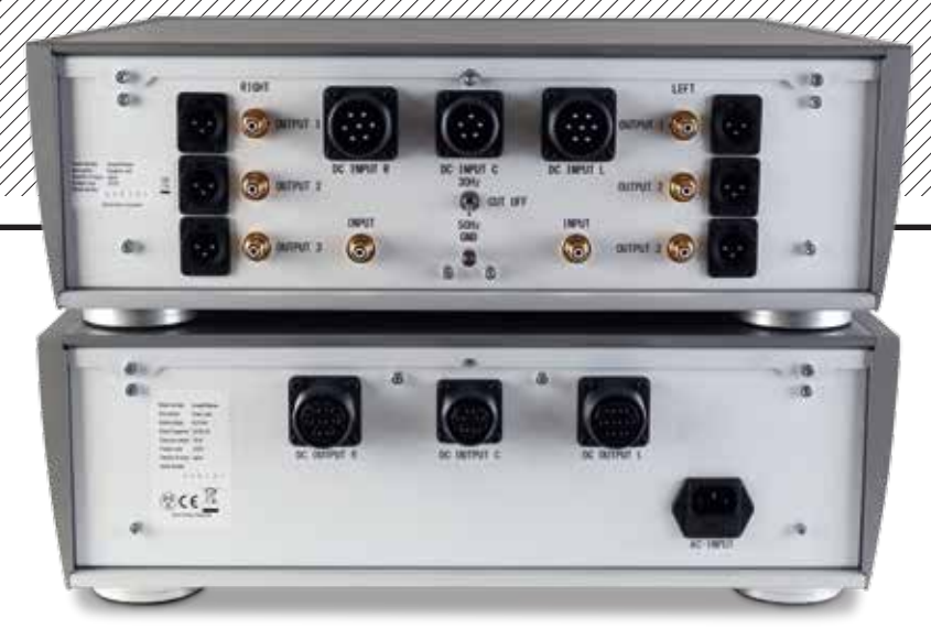
ABOVE: Rear view of the PSU [bottom] and equaliser [top]. The pick-up's internal LEDs are powered via the R- and L- pins while the output is returned via R+ and L+, all via the 'Input' RCAs. Three eq'd line outs, on RCAs and balanced XLRs, offer three bass roll-offs from two different – 30Hz and 50Hz – turnover freqs. [see Graph 1, opposite]

guitarist Steve Vai provides ample opportunity to assess the sheer mass of a recording. Vai's pyrotechnics are also ideal for gauging the attack of transients, while the vocals are out of the stadium filler's handbook.